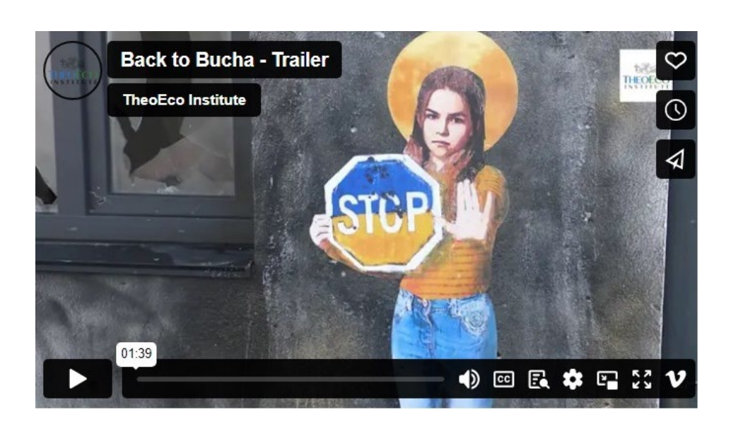
Back to Bucha Trailer

There are three versions: 27-minute, 57-minute, and 76-minute versions with and without Ukrainian and English captions.